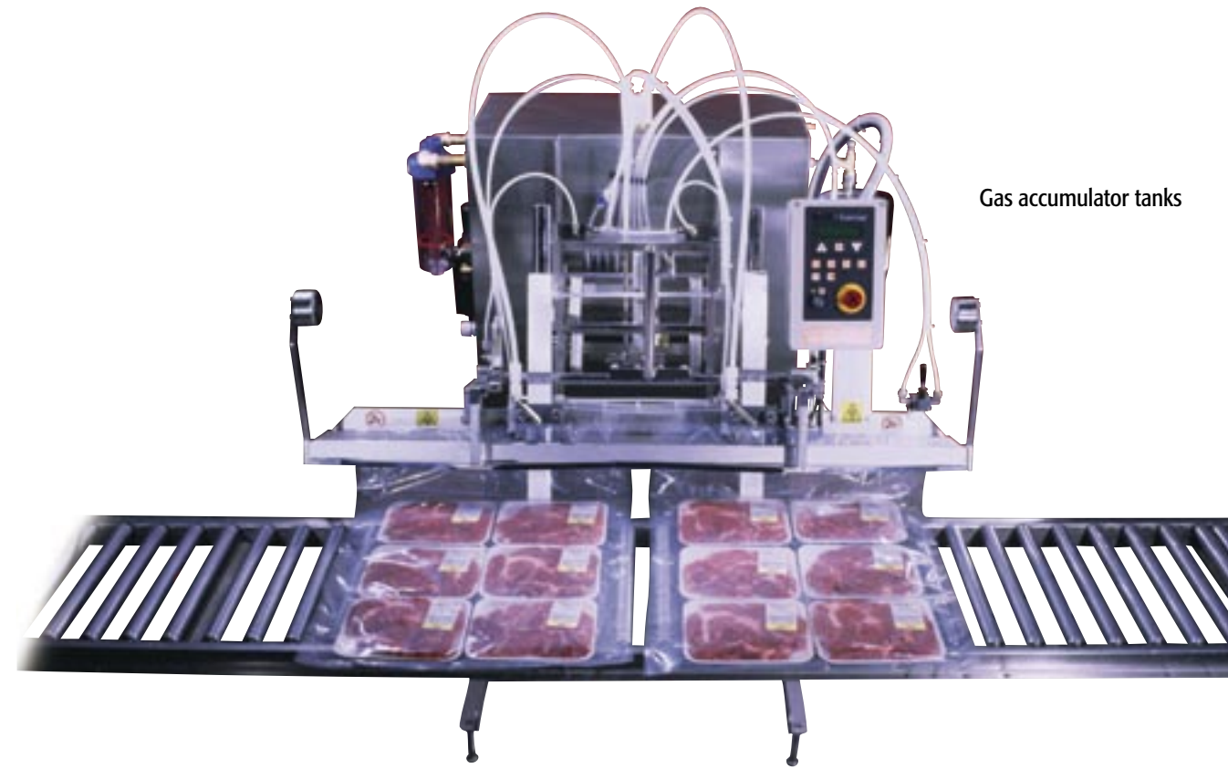
Gas accumulator tanks

M-TEK's patented process for horizontal packages provides faster cycles, optimal gas balance.