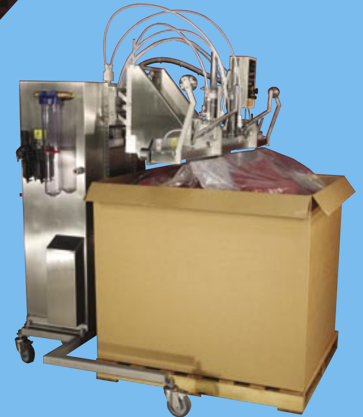
Large bottle filters