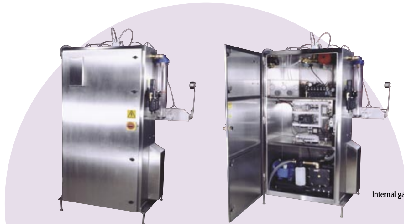
Internal gas mixers

M-TEK's patented process for horizontal packages provides faster cycles, optimal gas balance.